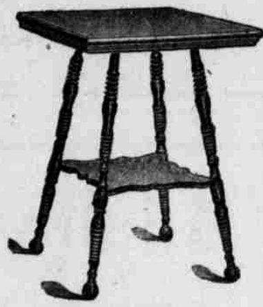
Golden oak parlor table, size 24 in. by 24 in. Special price $2.