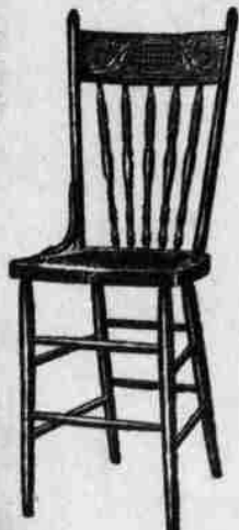
Golden oak finished dining chair, either cane or cobler seat. Special 85 cents