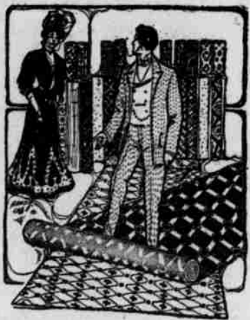
Special sale of carpet and linoleum remnants at prices below cost on regular goods. We are giving 20 per cent discount.