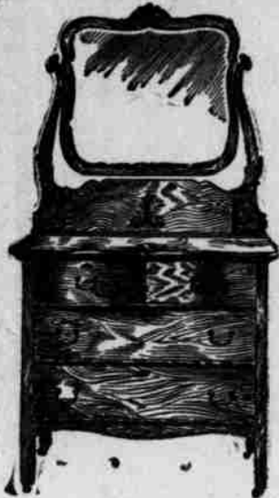
The full sized dresser finished in golden oak. Special during our clearance sale .....$7.50

Special Offering of Bargains in All Lines of House-furnishing Goods