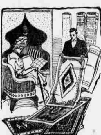
Our endless stock of Rugs in all sizes and qualities are now offered at reduced prices.