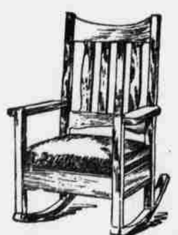
Straight Chairs and Rockers. Our full line of delayed holiday stock is now on display at the usual 20 per cent discount.