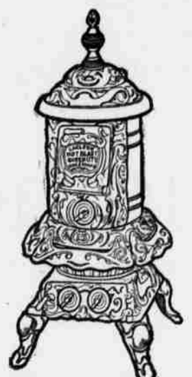
We are overstocked on Heating stoves and as special inducement we are offering 25 per cent discount on all of our heating stoves.