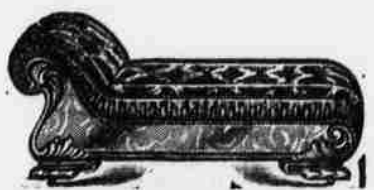
A full line of Couches, upholstered in leathers and velours are now on display at sacrifices.