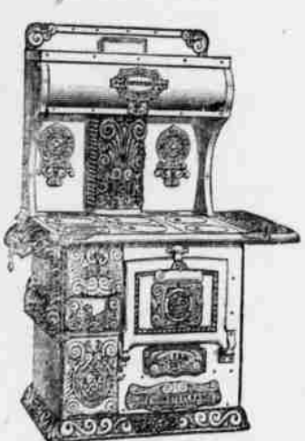
Special sale of Steel Ranges. This range is all blue steel body, drop door feed, full nickel trimmed and asbestos lined. Special $25

Twenty per Cent. Discount on Each and Every Article in Our Stock.