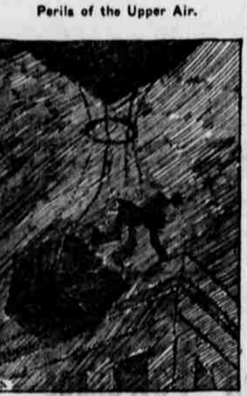
Exasperated Balloonatic (colliding with skyscraper)—Confound it! Something's got to be done to compel these tall buildings to carry lights!

Perils of the Upper Air. Exasperated Balloonatic (colliding with skyscraper)—Confound it! Something's got to be done to compel these tall buildings to carry lights!