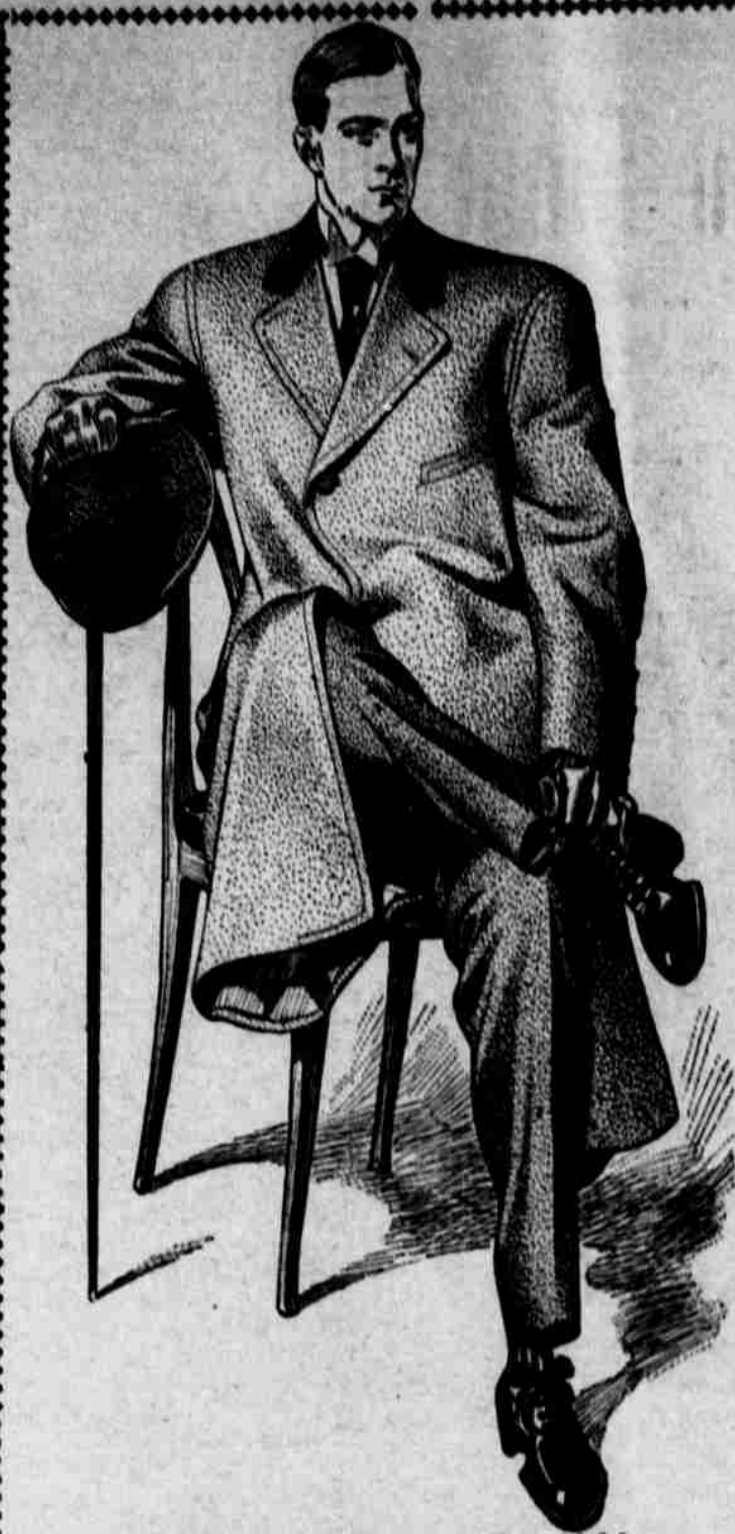
Copyright 1907 by Hart Schaffner & Marx