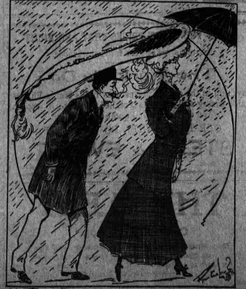
On a rainy day those new style hats for women may have their uses after 1.—Observations from the Mere Man's Notebook.

Seven doctors worked all of last night over their patients and it is possible that three or four of the victims ma-