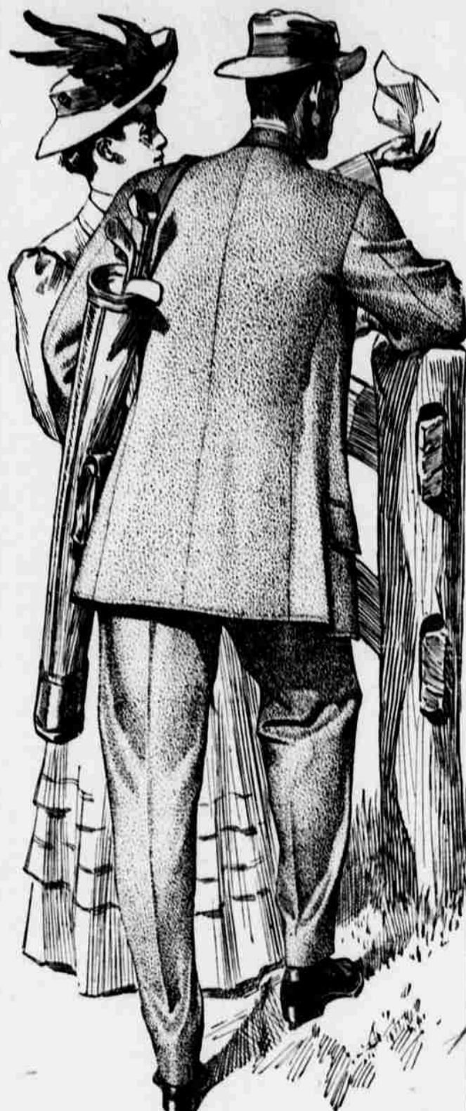
Copyright 1907 by Hart Schaffner & Marx