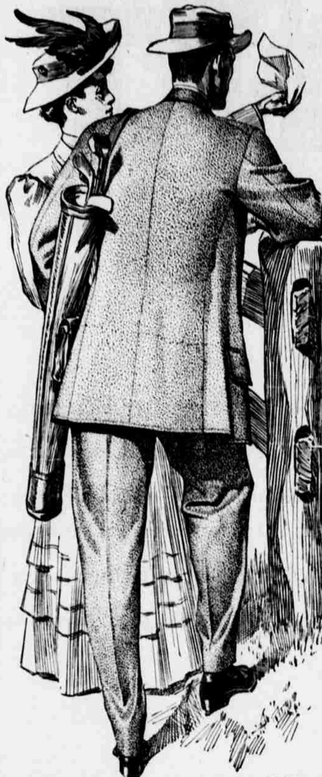
Copyright 1907 by Hart Schaffner & Marx

CHIEF QUARTERMASTER'S OFFICE, Vancouver Barracks, Wash., Sept. 25, 1907. Sealed proposals, in triplicate, will be received at this office until 11 o'clock a. m., October 24, 1907, and then publicly opened, for furnishing and installing electric light fixtures in new N. C. O. quarters, railroad station and postoffice at Fort Stevens, Ore. Full information will be furnished on application to this office and at office of Constructing Quartermaster, Fort Stevens, Oregon. The U. S. reserves the right to accept or reject any or all bids or any part thereof. Envelopes containing proposals should be marked: "Proposals for electric light fixtures at Fort Stevens," and addressed to the Chief Quartermaster, Vancouver Barracks, Wash.