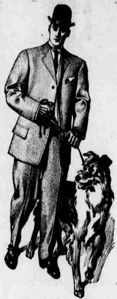
Copyright 1907 by Hart Schaffner & Marx