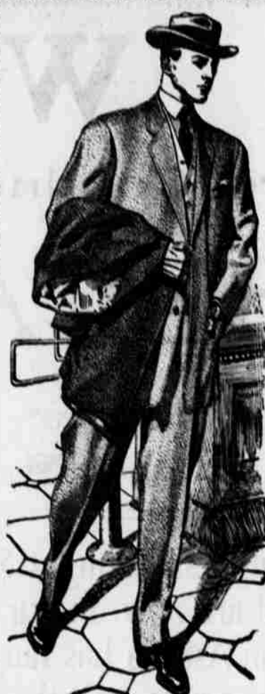
Copyright 1907 by Hart Schaffner & Marx