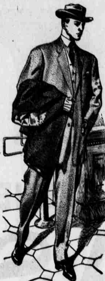
Copyright 1907 by Hart Schaffner & Marx