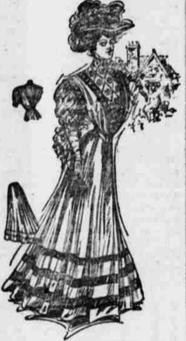
BROWN MARQUISEE FROCK—5673, 5622.

Striped suitings are extremely smart for the tailored gowns so much worn this season. Gray and white is the favorite combination, but white and brown or tan and blue is very attractive. The costume in the cut is of natural colored pongee trimmed with bands of light brown silk. The cape wrap has a collar of embroidered muslin that gives a dainty touch to the whole. JUDIC CHOLLET.