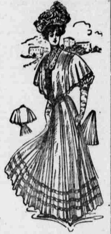
A PONGEE COSTUME—5678, 5676.

Effects in Silk Ties—Millinery Concepts For the Modish. The newest ties for linen collars are made of finely striped china silk. Green, mauve, gray and brown are to be seen in these concepts plaited into bunchy rosettes or double butterfly bows. Large birds are used on hats arranged flat on the crown with spreading wings and head placed just forward at the front of the crown. A pretty hat of the Dolly Varden style is in natural hemp straw with a