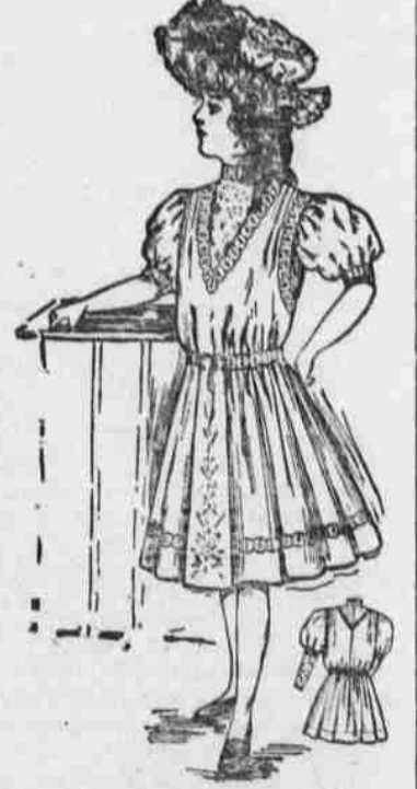
BLUE CHAMBRAY GOWN—6087.

Striped Shirt Waists For Morning Wear—New Handkerchiefs. Plain white shirt waists may have to forfeit some of their popularity, for colored and striped blouses in both silk and wash materials are to be seen at the most fashionable establishments. The colored and striped wash waists are made very simple, generally buttoning in front, with stiff linen collar and cuffs, much on the regulation tailor made model. Fine all over embroideries, flouncings, insertions, etc., into which touches of delicate color are introduced, will be