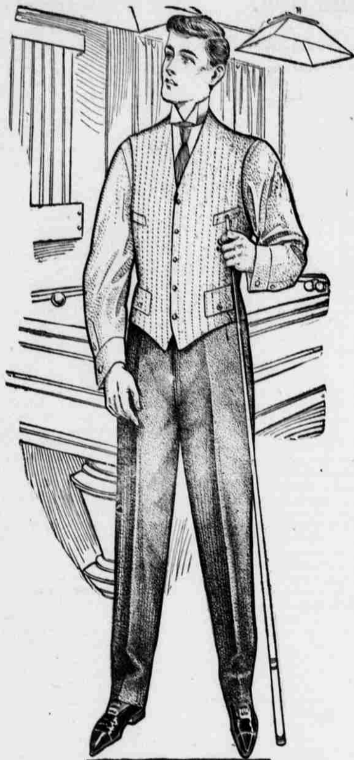
Correct Clothes for Men MADE IN NEW YORK Alfred Benjamin & Co. MAKERS NEW YORK