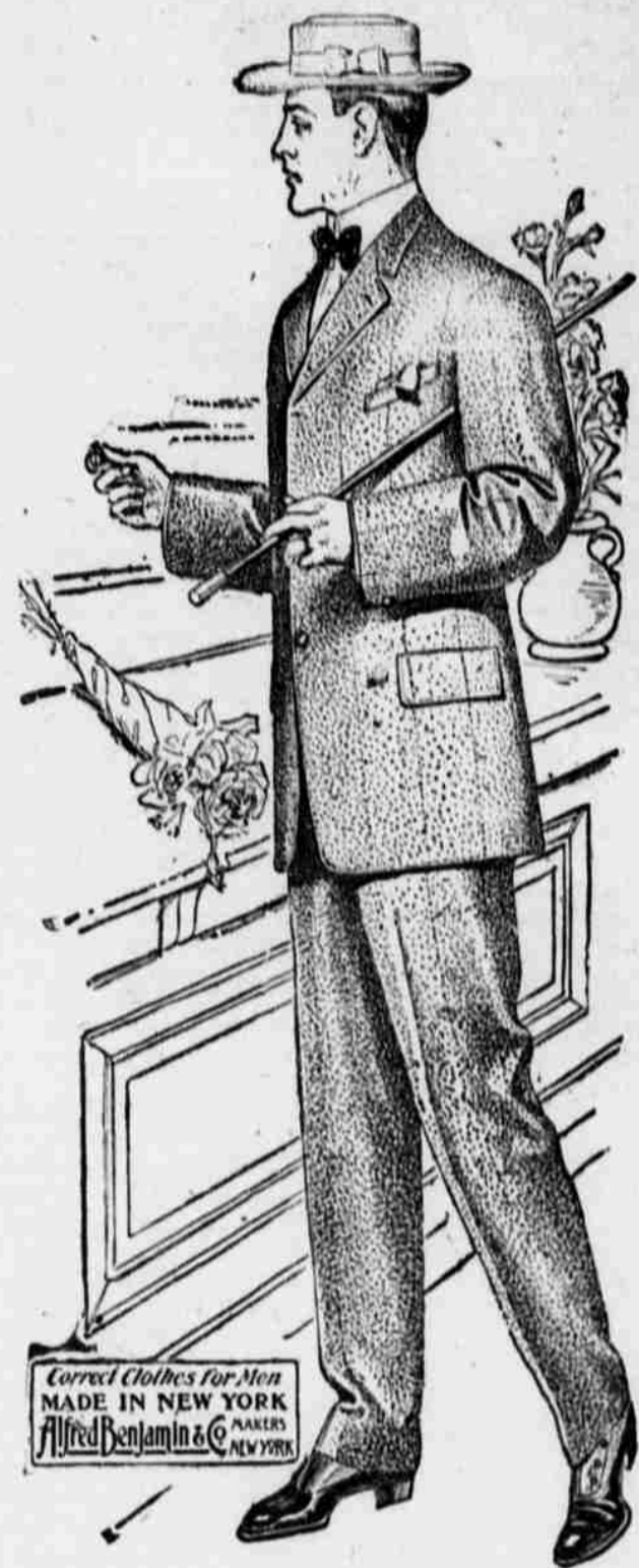
Correct Clothes for Men MADE IN NEW YORK Alfred Benjamin & Co. MAKERS NEW YORK

We want our customers to be the best dressed men in the city, therefore we are giving the best possible value for the money. We are going farther, we are donating to them the services of our tailor to keep their clothes pressed. This is the way we expect to build up our business.