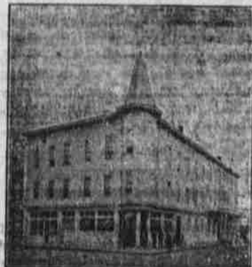
Good Sample Rooms on Ground Floor for Commercial Men.