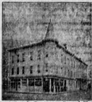
Good Sample Rooms on Ground Floor for Commercial Men.