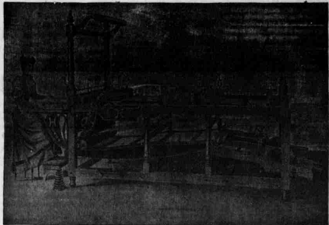
LATEST STYLE RULING MACHINE FOR RULING PAPER.

The majority of saw mills in the Northwest use our productions.