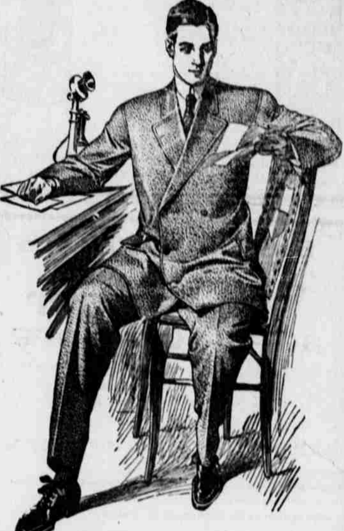
Copyright 1906 by Hart Schaffner & Marx Suits Pressed Free.

Something Different From the General Run