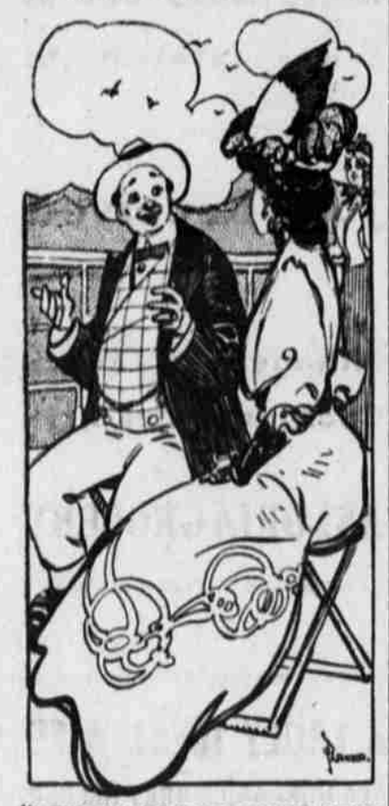
"I WILL BER YOU AGAIN. IN FACT, I WAN TO SEE YOU AGAIN.

The thing was as good as settled in an hour. Mr. Smithers was a man of forty. He was rather rotund and baid headed. He had just the faintest inclination to be flashy. Mr. Smithers was very democratic for a man worth untold millions. He made acquaintances rapidly, and the steamer had not made a hundred miles to the westward when he started a game of poker in the smoking room and had for companions a drummer, a cattleman, a ward politician and the inventor of the sausage stuffing machine. He was given a seat at the captain's table. It was afterward said that this was a mistake and