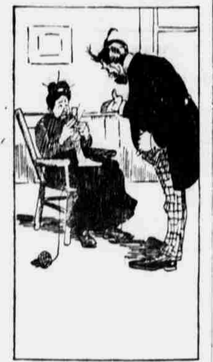
"WILL A LITTLE CHECK FOR $500 WIN BACK TOUR GOOD OPINION?"

Copyright, 1865, by McClure, Phillips & Co.1 AJOR CROFOOT, grand promoter and generally hard up man, was sitting in his office at 10 o'clock the other forenoon and wondering what had become of all the suckers in town, when the door quistly opened and a woman entered. The major had forgotten to lock the door, and he gave a start of surprise and turned pale. The woman advanced into the room, removed her bonnet and cloak and sat down. There was but little fire in the stove, and the room was chilly. After sitting for a moment she rose up and dumped into the stove the hod of coal which the ma-