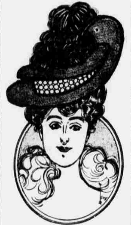
BLACK CHIP HAT.

Chinese blue liberty broadcloth trimmed with continental buff—which is