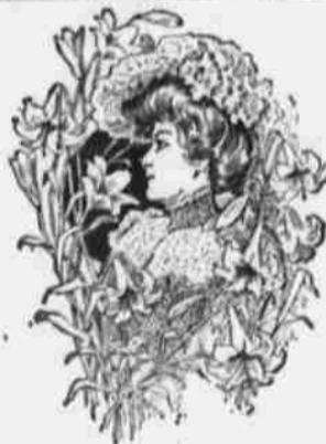
This week our annual

Astoria's Greatest Clothiers. 490-500 Commercial St.