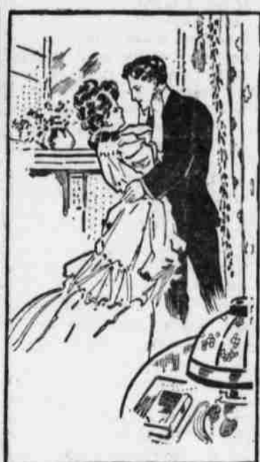
"OH, JOE, JOE!" I GURGLED AS HE CAUGHT

That drawer, with Its quaint contents, was an object of immense interest to me. It brought up slices of a