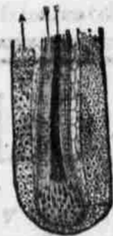
A Healthy Hair.