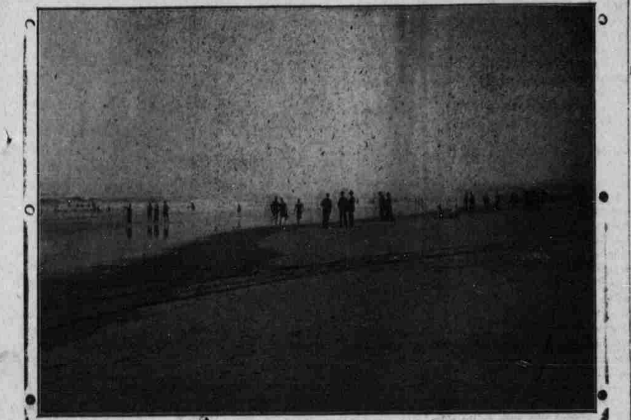
ON THE BEACH AT SEASIDE.