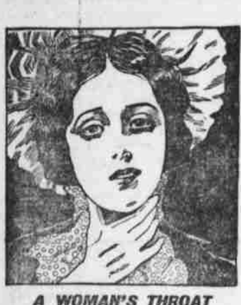
A WOMAN'S THROAT

Is her fortune if she chances to be a or Albani, and that fortune is guarde and night with the greatest care. Nothing frightens a singer so much as a cough. Every woman ought to be afraid of a cough. It is nature's danger signal. Who