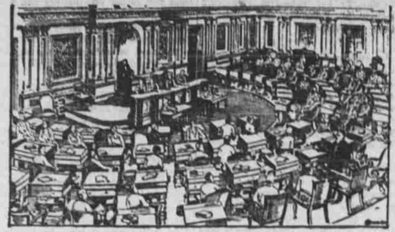
INTERIOR OF UNITED STATES SENATE CHAMBER.

[Prominent members of Congress that owe their health to Pe-ru-na.]