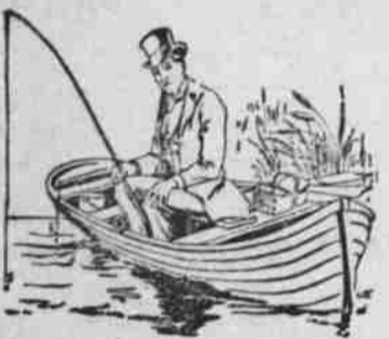
Fishing for Health.

No doubt is entertained that, if he seeks re-election at a special election to fill the vacancy, he will be returned to congress, perhaps without opposition, but it will be held by the house, according to the best authorities in both par-