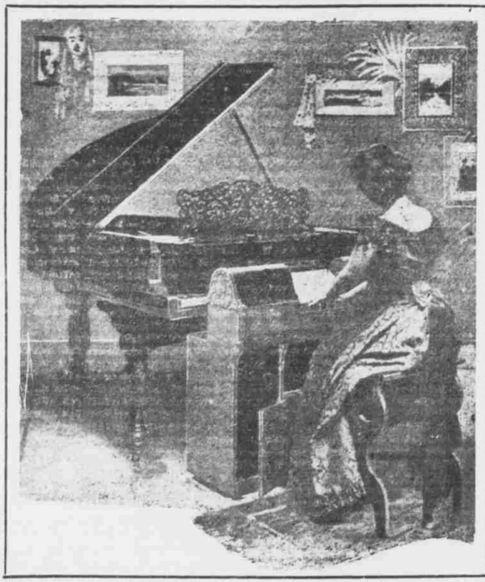
The Wonderful Pianola.