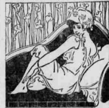
"My Corns Peel Clean Off, With 'Gets-It'!"

2 Drops, 2 Seconds—Corns Is Doomed! When you almost die with your shoes on and corns make you almost walk sideways to get away from the pain, take a vacation for a minute or two and apply 2 or 3 drops