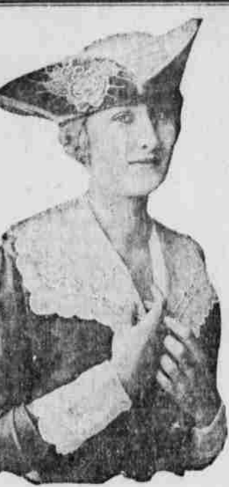
TWO IN ONE.

Old rose velvet trim and a pale pink felt crown make up this handsome tricorne. We must not overlook the gorgeous rose of gold thread embroidery. The collar and cuffs are linen hand embroidered.