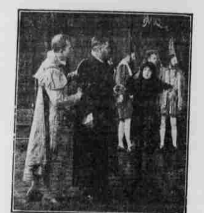
Scene from "The Prince and the Pauper."

Also PATHE WEEKLY, Showing Latest Current Events