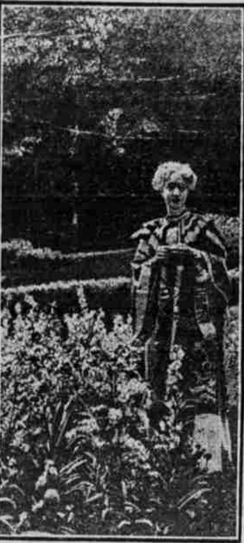
IN MANY HUES.

Her pictures on glass are seen in small boxes so arranged that the scenes get their effect from the sun at the back. There is every variety of