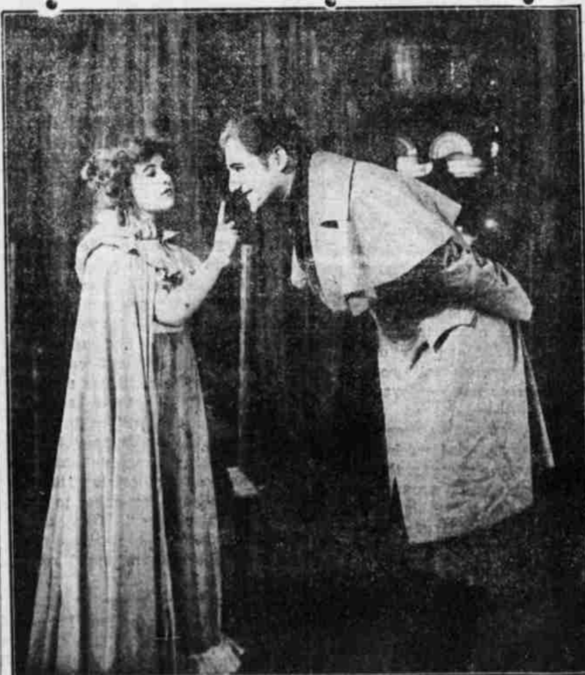
Another wonderful success for the Paramount Features by Five and Ten Cents

"Some men hope and some men fret, Some have pride and some regret, But the good or ill depends, After all, on what you get." —Mister Squeegie