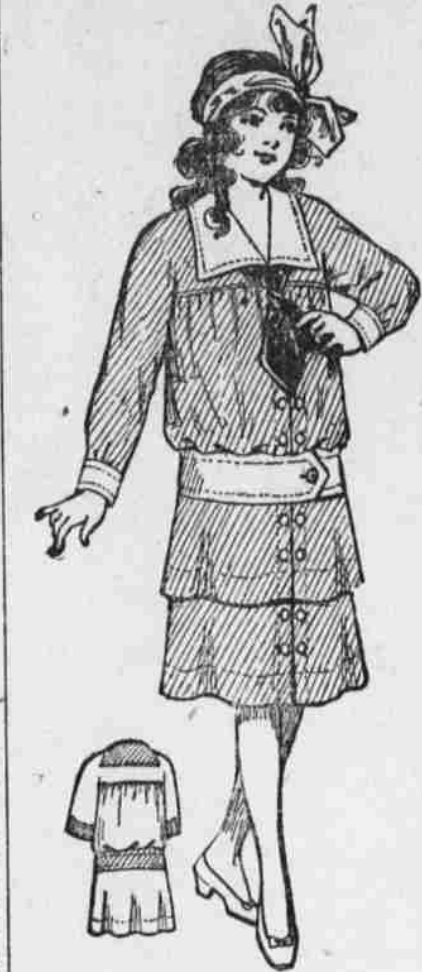
GIRL'S YOKE DRESS.

Plaid gingham is especially well liked for autumn wear, and plaid with trimming of plain or plain with trim-