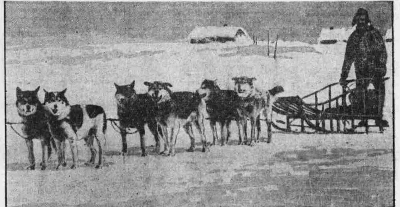
World famous Dog Team in Alaskan Photo-play, at the Vining Sunday and Monday

We will be closed all day July Fourth. Open Friday evening till 8 o'clock