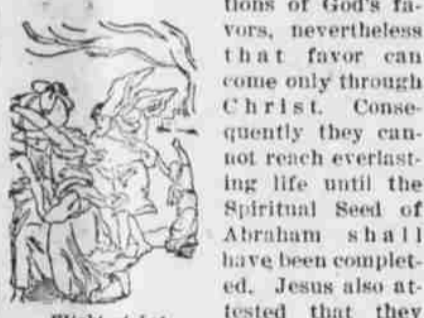
Flight of Lot.