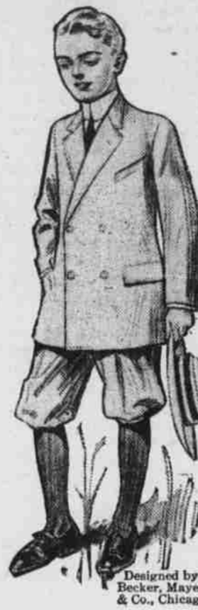
Designed by Becker, Mayer & Co., Chicago

Men's Underwear and Dress Shirts Men's 25c Balbriggan Shirts and Drawers, 19c Men's 50c Blue Ribbed Shirts and Drawers, 39c Men's 75c Negligee Dress Shirts, cut to 48c