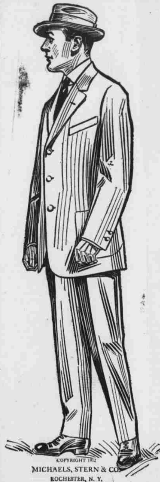
MICHAELS, STERN & CO. ROCHESTER, N. Y.

A Big Crash in Prices. The Goods Must Go. Read the Items Carefully