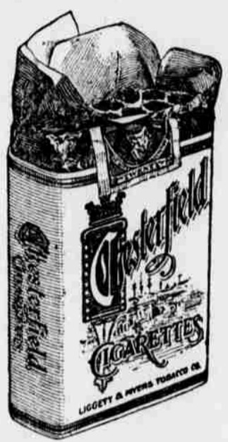
WE state it as our honest belief that for the price asked, Chesterfield gives the greatest value in Turkish Blend cigarettes ever offered to smokers. Liggett & Myers Tobacco Co.

FIXALL SHOP WELL WE FIX EVERYTHING CLOCKS A SPECIALTY Shoes, Boots, Clocks, Watches, Umbrellas, Pans, Buckets, Tubs, Boilers, Flashlights, Cut Agates, Sharpen Shears, Knives. Repair all kinds of things—Don't throw anything away, Come in and see us. Furniture Repair ed. GEO. LICKEY