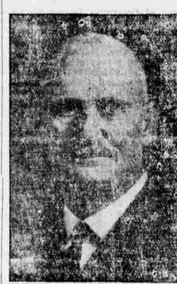
"No interests to serve but the Public Interests."-Hawley.

HON. W. C. HAWLEY Republican Candidate for Re-Nomination to Congress.