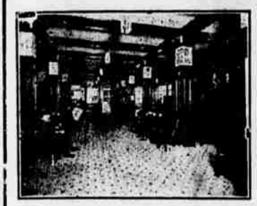
Popular Spacious Lobby