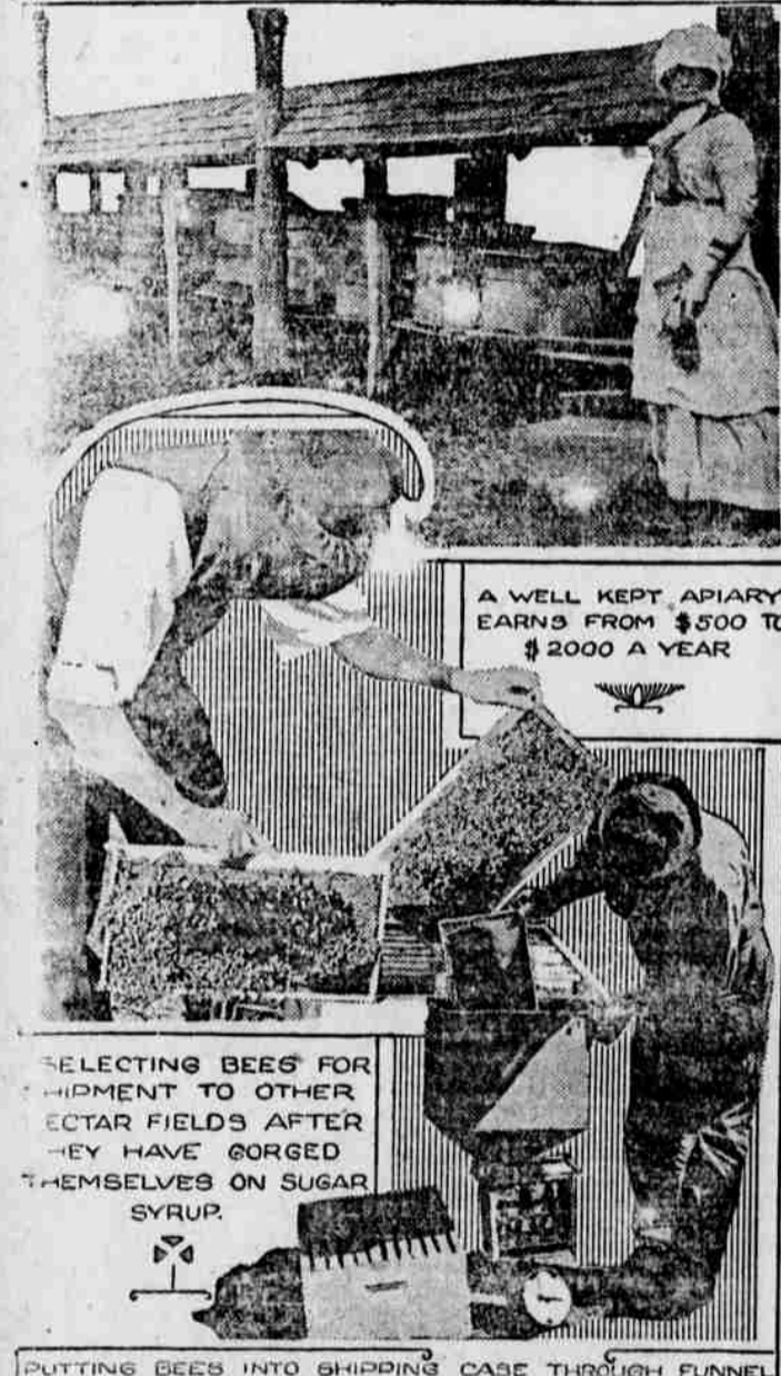
A WELL KEPT APIARY EARN'S FROM $500 TO $2000 A YEAR

SELECTING BEES FOR SHIPMENT TO OTHER PECTOR FIELDS AFTER THEY HAVE GORGED THEMSELVES ON SUGAR SYRUP.