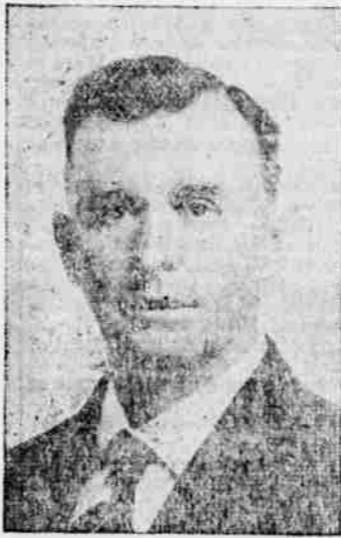
REPUBLICAN CANDIDATE FOR SECRETARY OF STATE

An open letter to the voters of Oregon: Hundreds have never written, telegraphed or asked me to become a candidate for Secretary of State; believing in the principle that if a man wants anything the best way to get it is to go out after it, and holding to the doctrine that under our form of government any citizen has a right to seek an office at the hands of the people, after due consideration, without undue influence, I have decided to become a candidate for Secretary of State on the Republican ticket at the May Primary election.