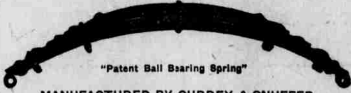
"Patent Ball Bearing Spring"