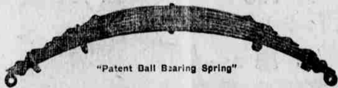
"Patent Ball Bearing Spring"

MANUFACTURED BY CURREY & SNUFFER Buick-Six For Hire