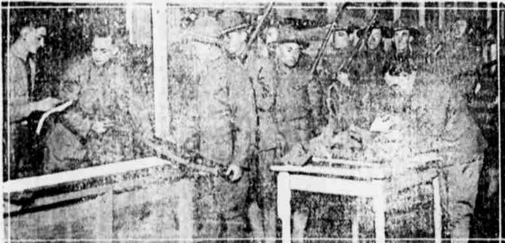
This photograph is dedicated to mothers, sisters and sweethearts of American soldiers who are holding to the fear that German trickery may yet result in resuming of fighting—and a loss of their loved ones. This picture is proof conclusively that the allies' armistice terms have reduced Germany to an utter state of military helplessness. It is the first picture of "American soldiers being mustered out of service." Yanks are here shown handing over their guns to the quartermaster department. Scenes like this will be common now—until the last Yank is back into peace fields.