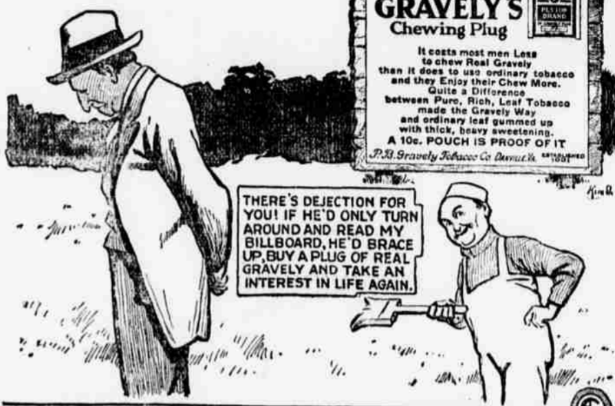
LOOK FOR THE PROTECTION SEAL—IT IS NOT REAL GRAVELY WITHOUT THIS SEAL