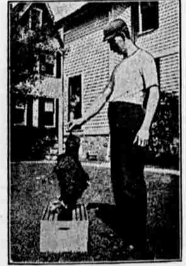
Swarming a Hive.

The bees of two lots may be united peacefully by sprinkling them thinly with sugar sirup flavored with peppermint, and then placing the frames with adhering bees alternately in a