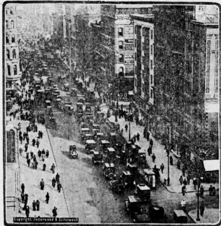
FIFTH AVENUE, NEW YORK.

down amongst them and be one of them. One Place Not Mythical. There is one place, however, which hasn't been relegated to the mythical. There most certainly is still a Coney Island. And whether you go quietly with a friend or whether you go with a crowd in a labeled and megaphoned sight-seeing car, it is the same Coney Island, with its blaze of lights and its blare of orchestras and its bewildering whirl of things to ride and things to see, and things to do, and things to eat and drink, the latter consisting chiefly of "hot dogs" and beer. But, however genuine Coney may be, there's no denying the spirit of graft that pervades the atmosphere of skyscraper land. On every hand some person or some organization is trying to get some thing for nothing, and if you are weak enough to be caught, it's like buying 25-cent silk stockings, and serves you just right. Perhaps some evening after the theater you stop in a high-class cabaret to enjoy a dance or two and a sandwich. At the entrance you are