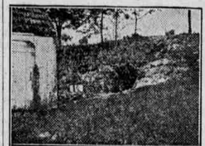
A Spring With a Good Location.

If the water supply on the farm is obtained from a spring, every effort should be made to guard the spring from pollution of any kind. An open spring may be contaminated from surface drainage and from seepage, and