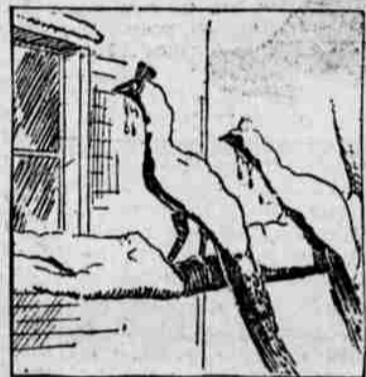
Roosting in the Snow.

The hereditary habit of the peacocks of roosting for the night in trees sometimes forces upon them considerable discomfort. After selecting a roosting place, says Dumb Animals, the birds return to it each night, apparently the same ones, without ever