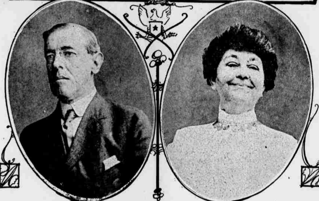
Essex Troop of New Jersey, Inauguration Escort, and President and Mrs. Woodrow Wilson