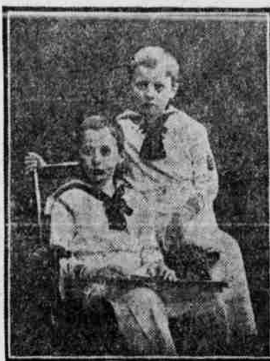
ELDER HESSE TWINS.

Hesse twins, born May 1, 1901, are the children of Prince Frederick Charles of Hesse and his wife, who is the youngest sister of the German emperor. The elder boys, also Hesse twins, were born Nov. 6, 1896, and their names are Philip and Wolfgang. There