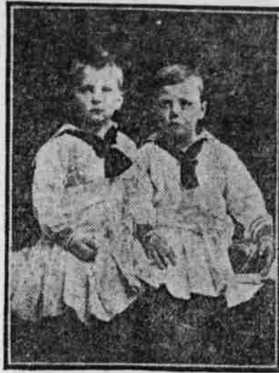
YOUNGER HESSE TWINS.

Interesting among the twins of royalty are the two sets of Hesse twins and the Hohenzollern twins. Princes Richard and Christopher, the younger